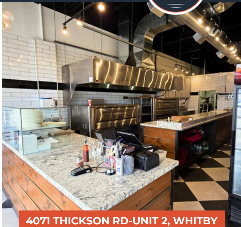
4071 THICKSON RD-UNIT 2, WHITBY