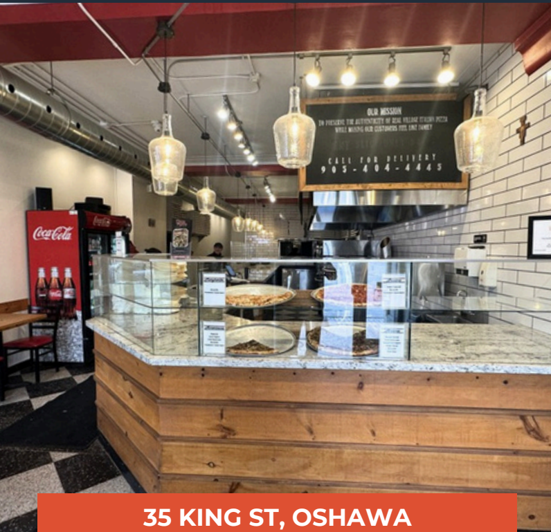
35 KING ST, OSHAWA